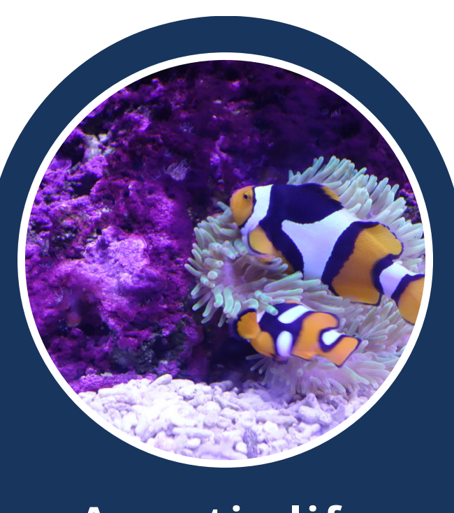
Aquatic life deaths